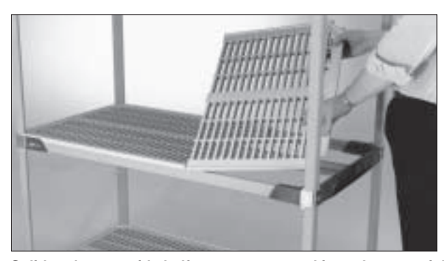
Solid and open-grid shelf mats remove and interchange quickly.