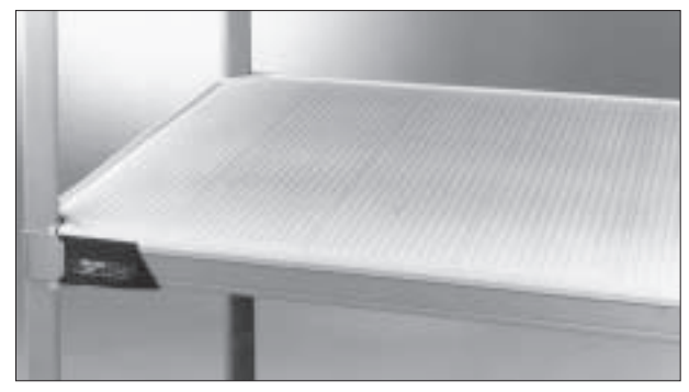
Solid Shelf Mat