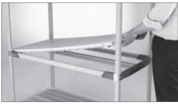
Solid and open-grid shelf mats remove and interchange quickly.