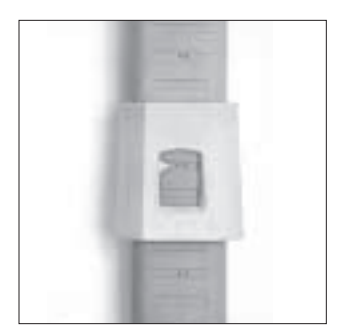
Wedge lock connector attaches easily to post.