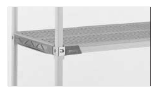
MetroMax mat kits with Microban® antimicrobial product protection are available to upgrade existing MetroMax storage systems.