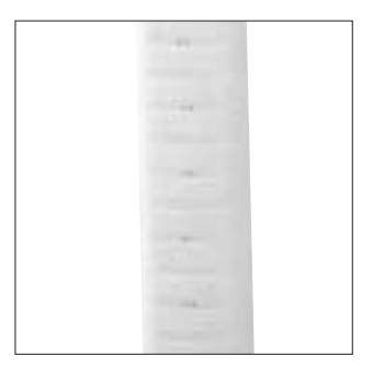
Posts are numbered at 1" (25mm) intervals.