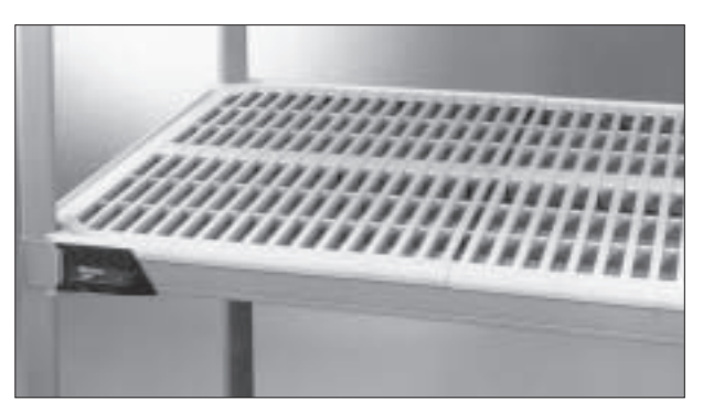
Open-Grid Shelf Mat